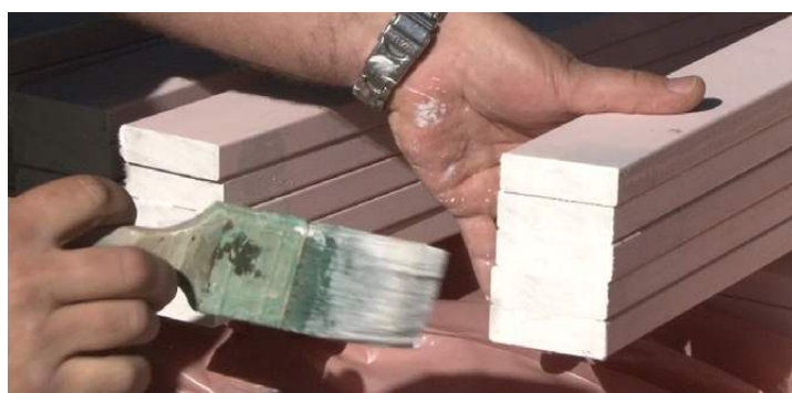
Photo 2: Also apply oil-based alkyd primer over supplementary preservative applied to all cut ends, holes, notches etc