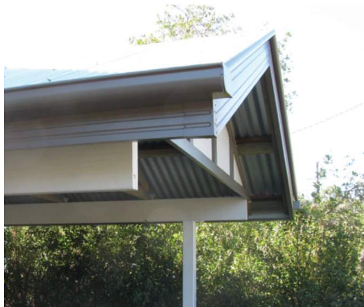
Photo 4: Adequate overhang and quality pale coloured paint system provide good protection to end grain and sun exposure.

Apply two topcoats of either quality acrylic or solvent based paint to the prepared product. In harsher environments high gloss paints are recommended.