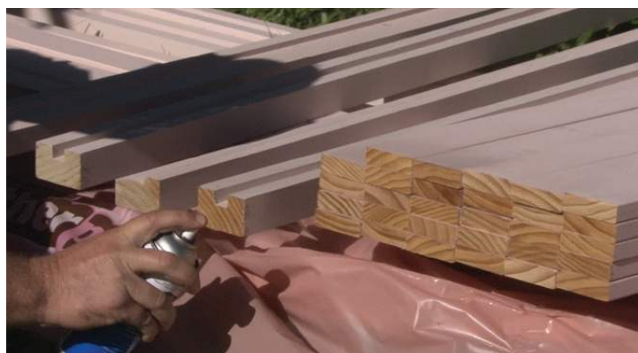
Photo 1: Avoid premature failure by applying a brush on or spray on supplementary preservative to all cut ends, holes, notches etc.

This data sheet provides information and advice aimed at improving and ensuring the in-service performance of these products such as beams, cladding, hand rails, posts, newels, mouldings, decking etc. These products may include solid timber, laminated & finger jointed timbers and LVL.